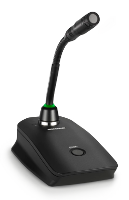
MXW8 Gooseneck Base Transmitter