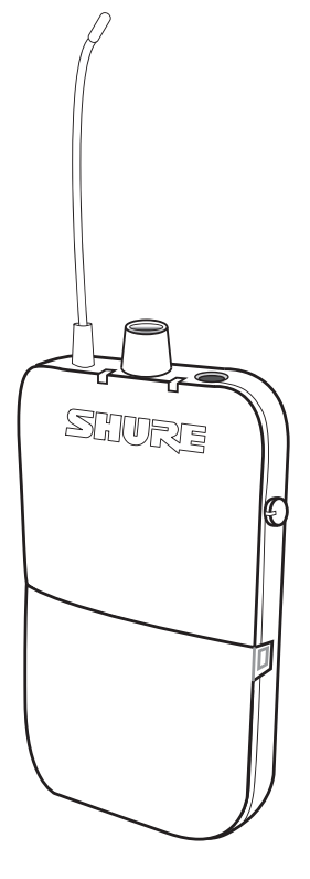
P3R Wireless Bodypack Receiver