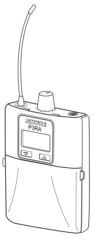
P3RA Professional Bodypack Receiver