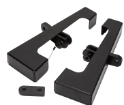
LINK BAR FL-B LINK TT 4