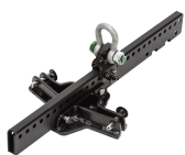
FLY BAR FL-B V TT 4